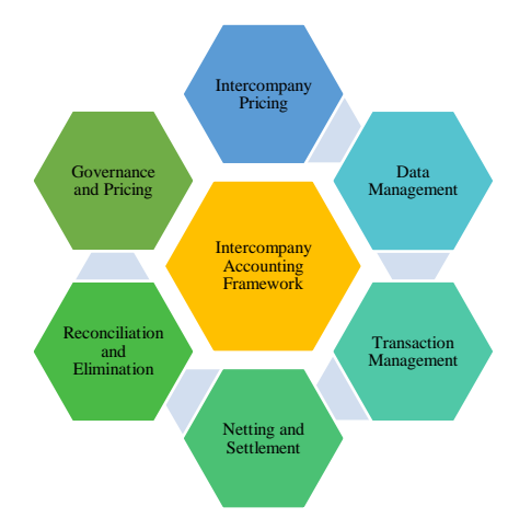
Fig. 2 IC Framework