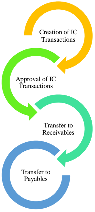
Fig. 4 Invoice flow in Intercompany transactions

transaction volume is high, most companies use the FBDI excel template for uploading the transaction in the Oracle application. When the receiving company approves the transactions, they get transferred to the general ledger if the entity does not require the invoice or sub-ledgers, and settlement happens via booking the journal entries in the general ledger. If invoices are required to be booked, the IC system generates the receivable invoices to collect the charges for services, and the receiver book payable invoices for compensating the received services. IC transactions in respective AR and AP are settled via the netting process. The flow of IC transactions is depicted below-